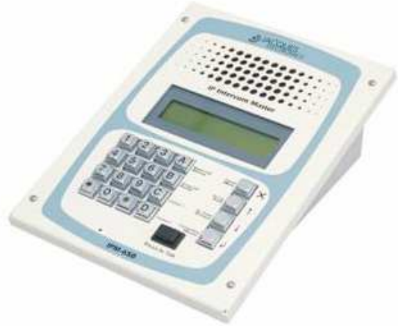
Desk mount model shown

The JACQUES IPM-650 is a master intercom station for the 650 Series VoIP (Voice over IP) Intercom System . It is a simple and easy to use unit that provides the user the power to call any slave, master or PA interface under the control of the system server. It seamlessly integrates into an existing 10/100 Ethernet network and can be conveniently powered by PoE (Power over Ethernet).