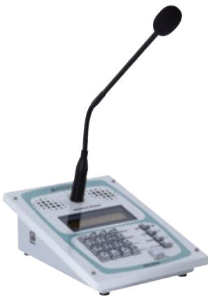
Public Address Master Intercom Station