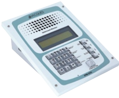
Master Intercom Station

The JACQUES IPM-350 is the master intercom station for the 650 Series IP Intercom System. It is a simple and easy to use unit that provides the user the power to call any slave, master or PA interface under the control of the system server. It seamlessly integrates into an existing 10/100 Ethernet network and can be conveniently powered by PoE (Power over Ethernet).