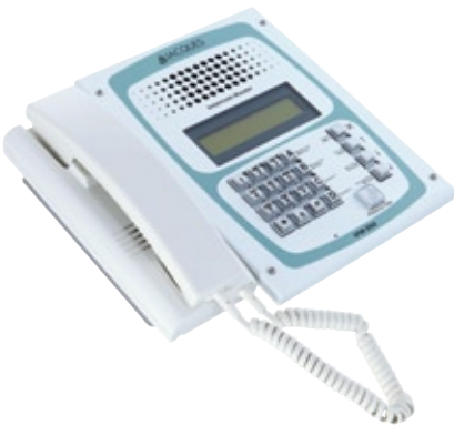
Master Intercom Station with Handset