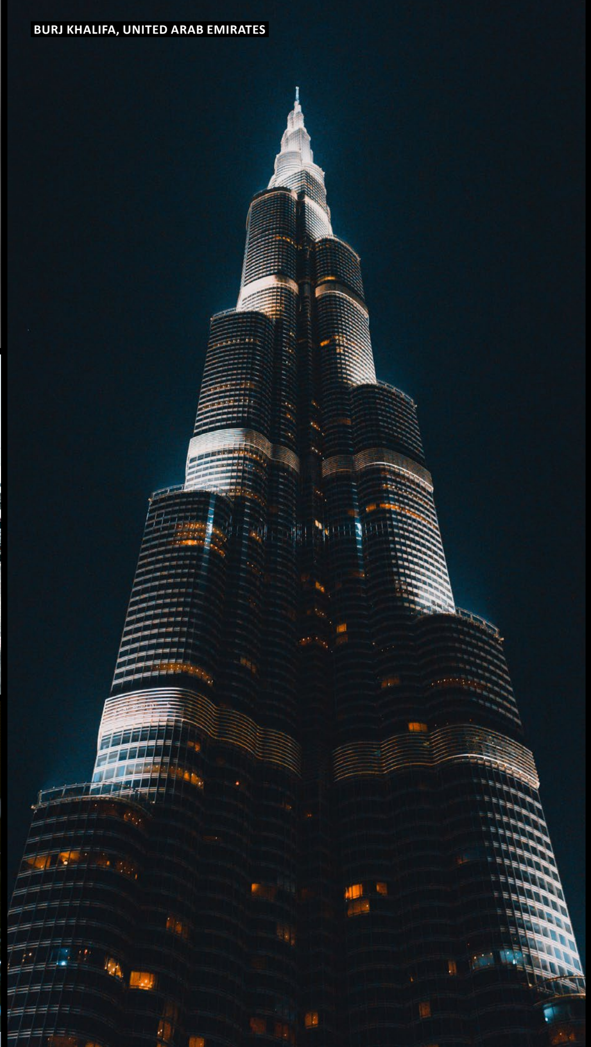
BURJ KHALIFA, UNITED ARAB EMIRATES