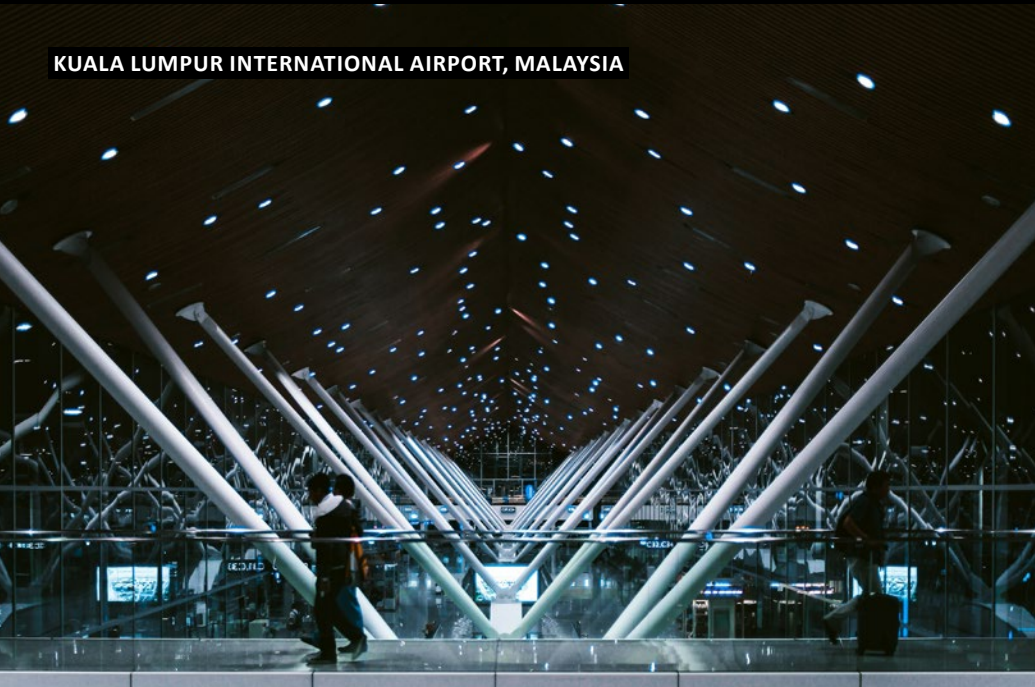
KUALA LUMPUR INTERNATIONAL AIRPORT, MALAYSIA