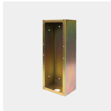
FWE-1 | 60701