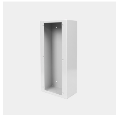
SWE-1 | 60709