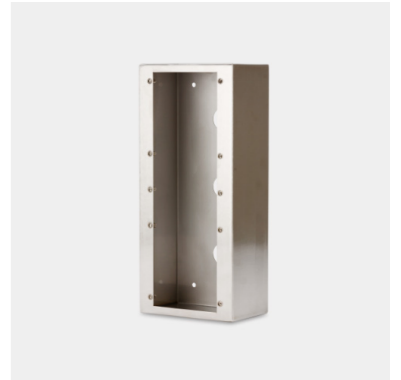
SWE-9SS | 60708