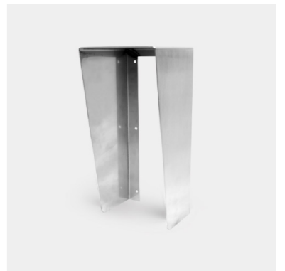
SRH-2 | 51190